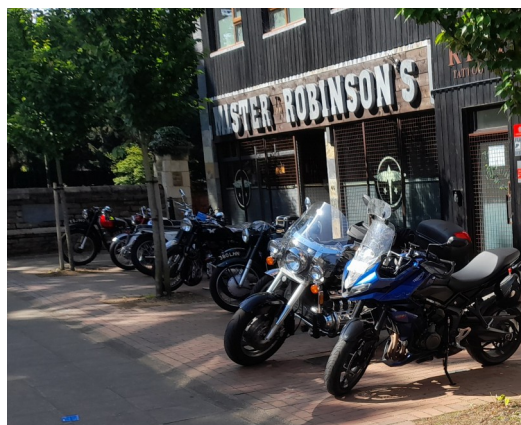
Images from this years Rugby Bikefest